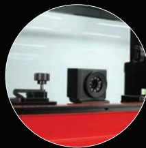
Self Calibrating Camera