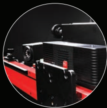
Crossbar Control Pitch, Roll, Yaw and Center