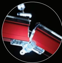
New Folding Crossbar Locking Mechanism