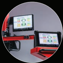
Dual Screen Operation