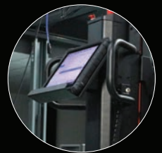
Consolidated Power Supply