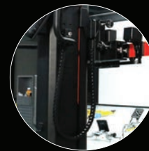
Built-In Cable Management